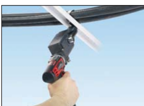
360° Rotating Head